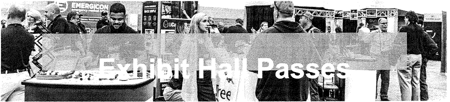
Exhibit Hall Passes

The Texas EMS Conference Exhibit Hall Pass allows guests 2 days of access to 160,000+ square feet of the latest EMS, fire and disaster management products – all under one roof! This is your once-a-year opportunity to meet and interact with hundreds of industry-leading representatives and engage with thousands of first responders from across the state during the welcome reception and other special events.